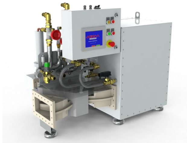
Fig. 1. Microwave generator 18 kW, 915 MHz – power supply and microwave head & isolator