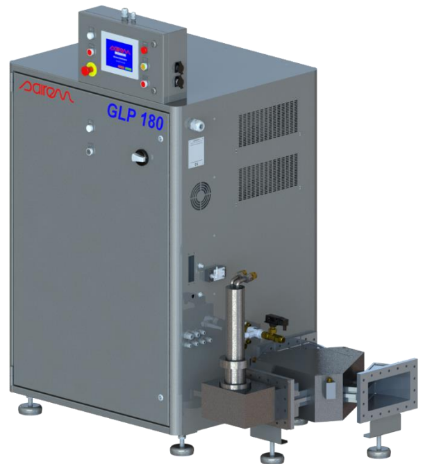
Figure: 915 MHz, 35 kW continuous wave generator (single cabinet) – represented with isolator

SAIREM's built-in Automatic Restart Function (ARF) avoids the total shutdown of the generator during a process if accidentally the magnetron switches off. All operational parameters and faults are available on the touch screen colour digital HMI. The position of the HMI can be changed depending of the customer's requirement.